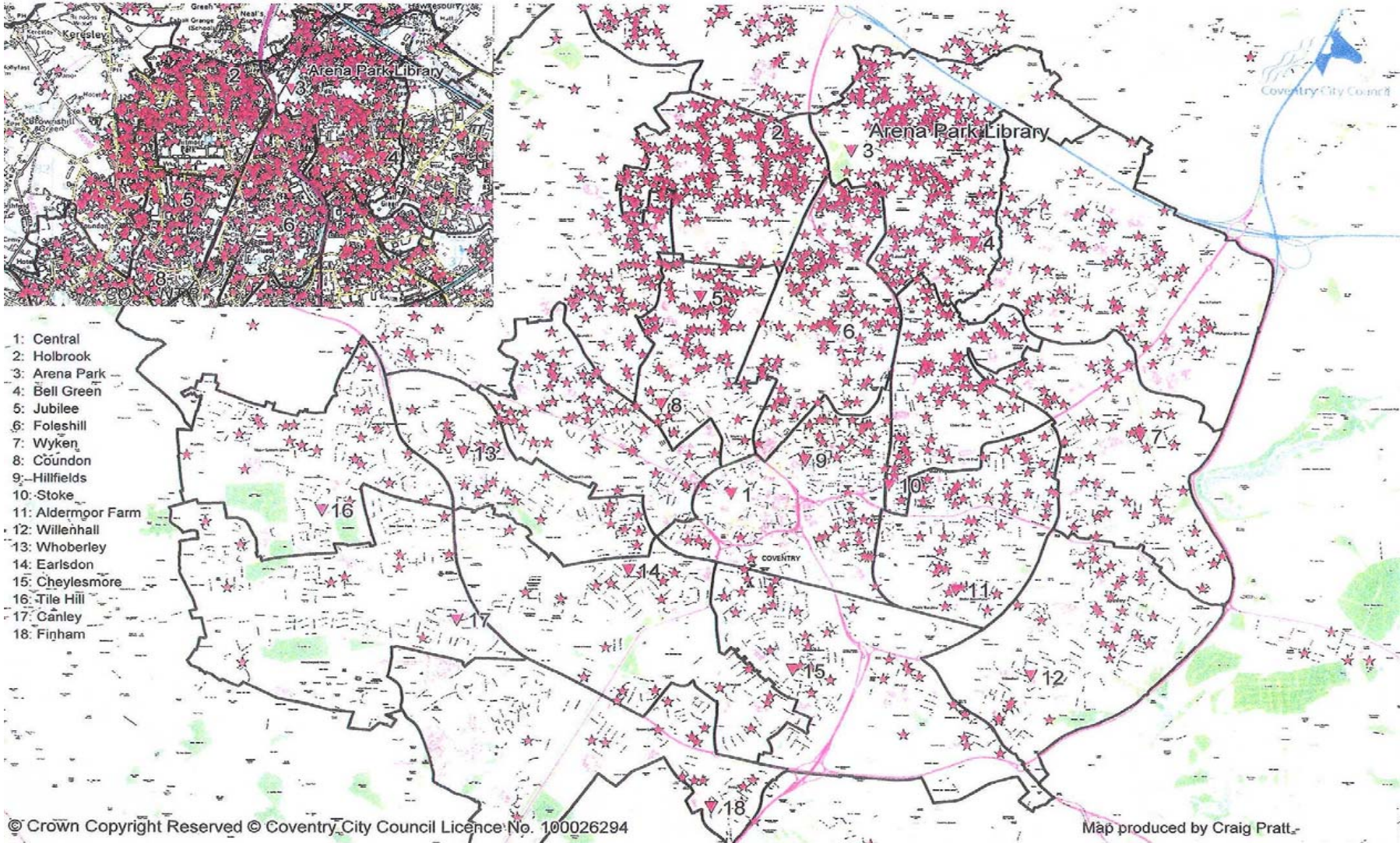
Arena Park Library - Origin of Borrowers -